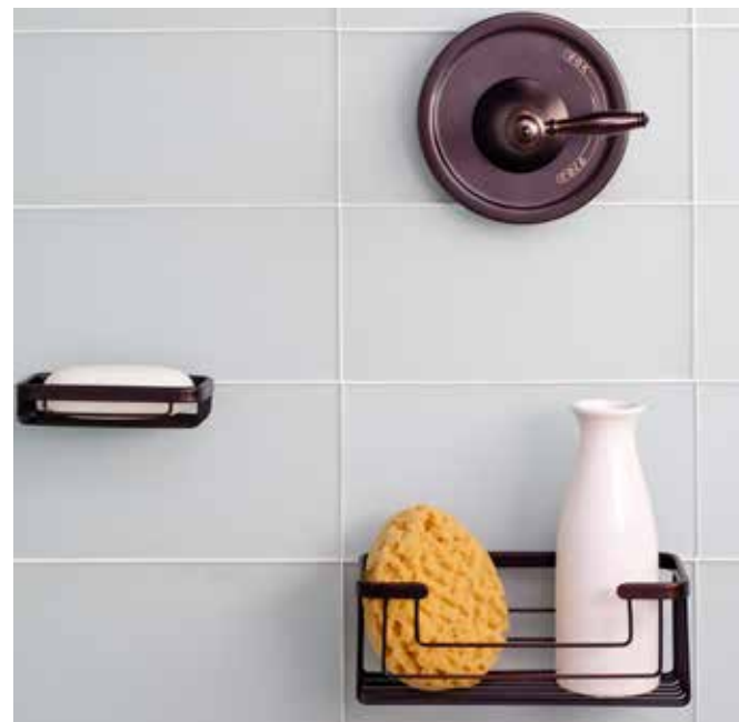
Oil Rub Bronze

Located below the shower trim without penetrating the wall cavity