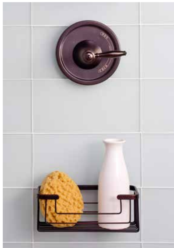
Oil Rub Bronze