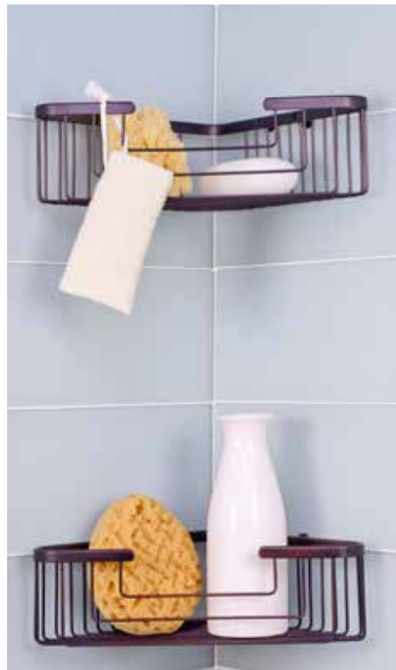
Oil Rub Bronze