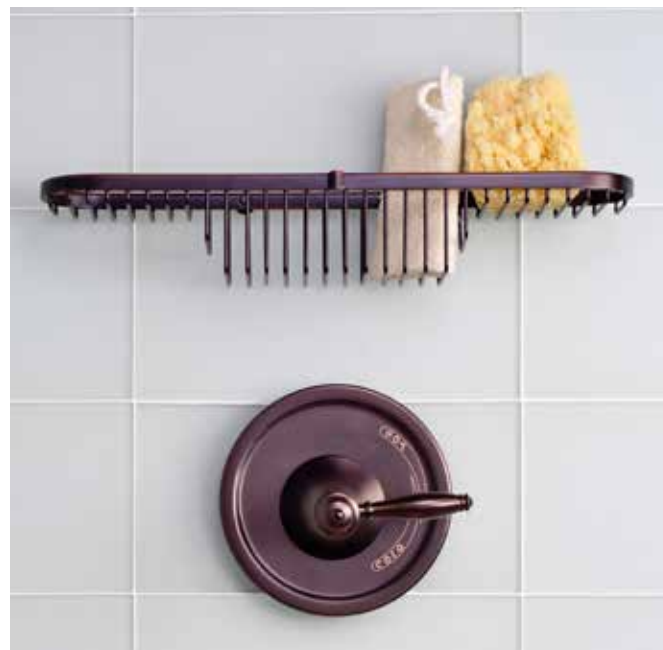
Oil Rub Bronze

Located above the shower trim without penetrating the wall cavity