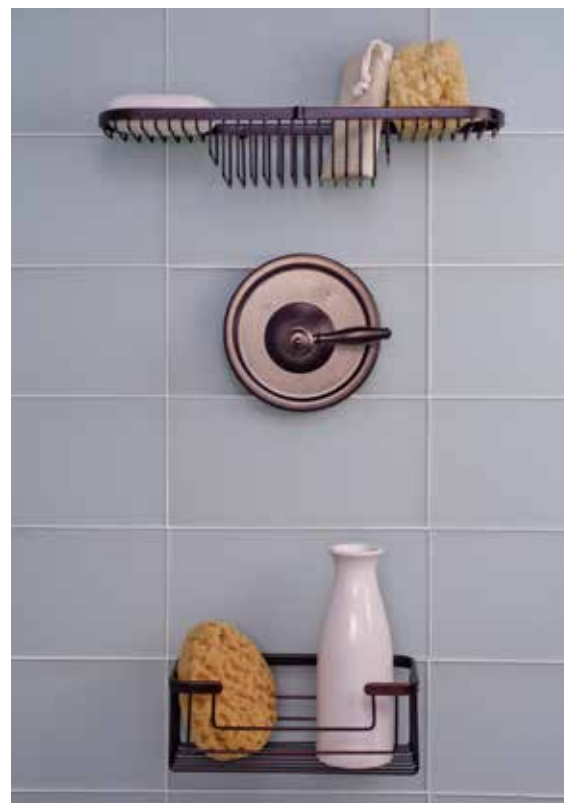
Oil Rub Bronze