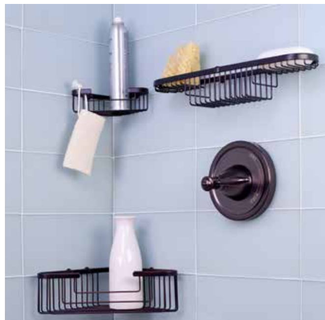
Oil Rub Bronze

Solutions that will personalize your body care products