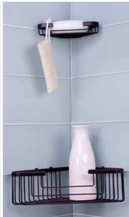
Oil Rub Bronze