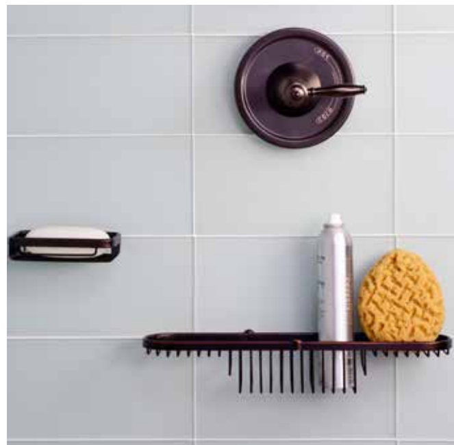
Oil Rub Bronze