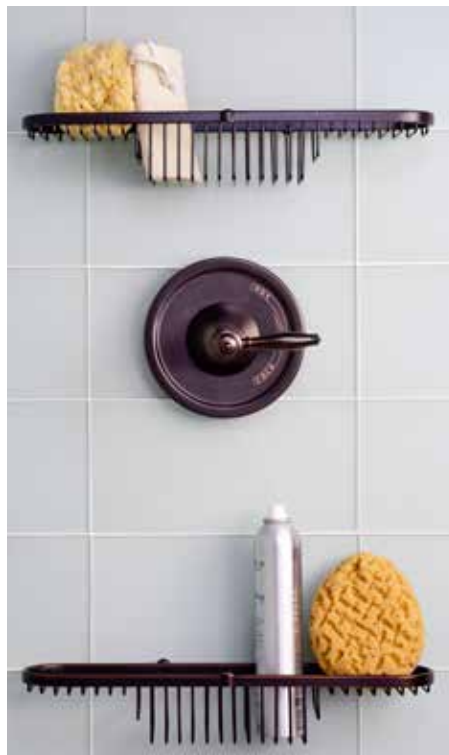
Oil Rub Bronze