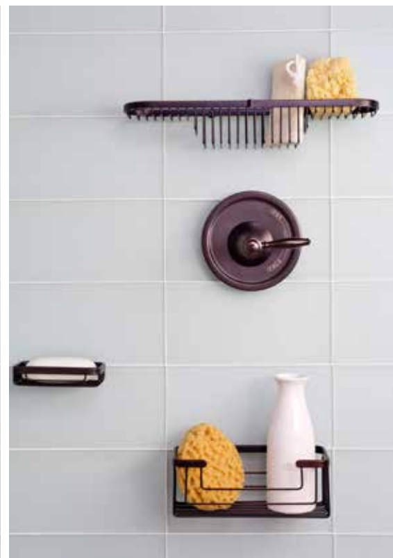
Oil Rub Bronze