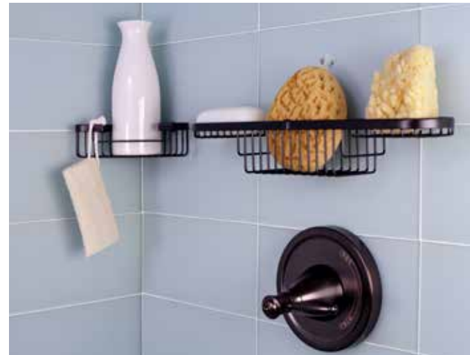
Oil Rub Bronze

Expand your organization options, locate baskets on the plumbing wall and in the corner