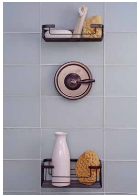
Oil Rub Bronze